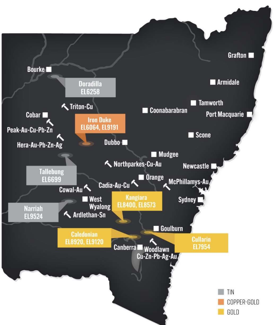
Figure 2: SKY Tenement Location Map

Highlight, 'McPhillamys-style' gold results from previous exploration include 36m @ 1.2 g/t Au from 0m to EOH in drillhole LM2 and 81m @ 0.87g/t Au in a costean on EL8920 at the Caledonian Project.