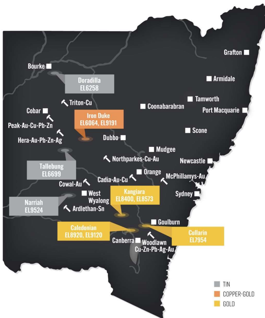
Figure 2: SKY Tenement Location Map

Highlight, 'McPhillamys-style' gold results from previous exploration include 36m @ 1.2 g/t Au from 0m to EOH in drillhole LM2 and 81m @ 0.87g/t Au in a costean on EL8920 at the Caledonian Project.