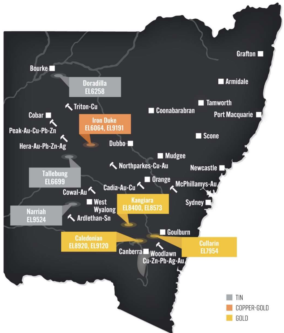
Figure 2: SKY Tenement Location Map

Highlight, 'McPhillamys-style' gold results from previous exploration include 36m @ 1.2 g/t Au from 0m to EOH in drillhole LM2 and 81m @ 0.87g/t Au in a costean on EL8920 at the Caledonian Project.